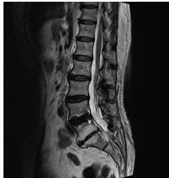
Fig. 1. Magnetic resonance imaging lumbosacral spine T2-weighted sagittal image showing postoperative discitis at the L5–S1 level.