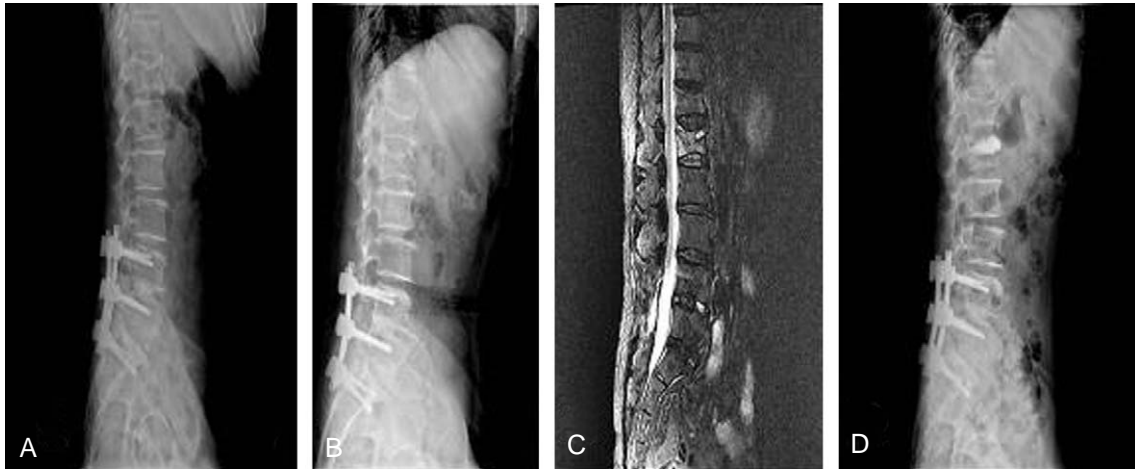
Fig. 1. A 66-year-old female radiographs. (A) Instrumented posterior lumbar interbody fusion was done for spinal stenosis. (B) At postoperative 16months, L1 compression fracture was developed after slip down. (C) Lumbar magnetic resonance imaging with T2 image shows signal change at L1 body. (D) Kyphoplasty was done at L1 body because of continuous back pain in spite of conservative therapy.