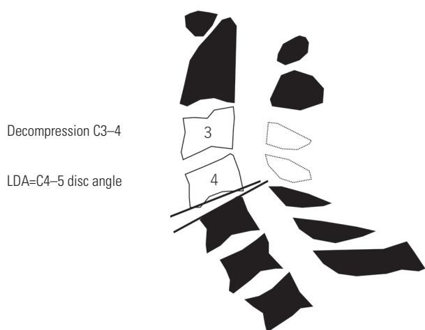
Fig. 2. Lower disc angle. Lower disc angle (LDA) was defined as a LDA at the decompression site. LDA was measured as C4–C5 Cobb angle for C3–4 laminectomy.

no narrowing of the disk space, grade 1, less than 50% loss of height, and grade 2 more than 50% loss of height. The total disk height is the sum of the grades of all intervertebral discs. The lower adjacent DHG was the DHG of the intervertebral space measured at the LDA.